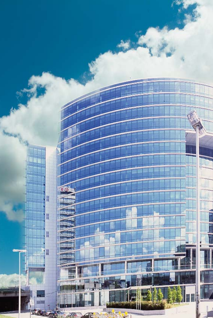
Brussels U.E. District