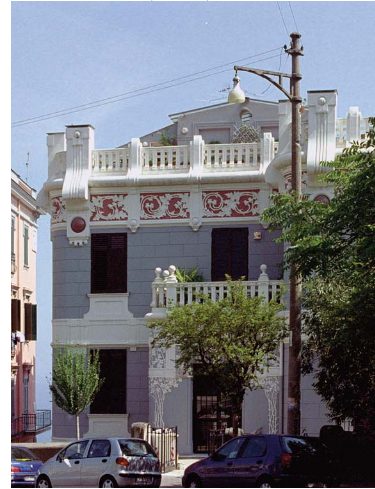
District Art Nouveau (style Liberty)