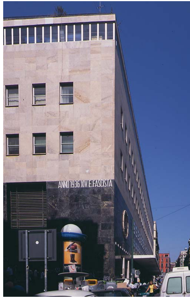
Central Post Tation (Architecture Fascista 1936)